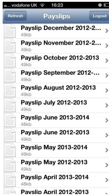
Mobile login display